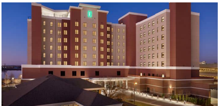
2020 Fall Educational Conference Wilmington, Embassy Suites Hotel September 16-18, 2020