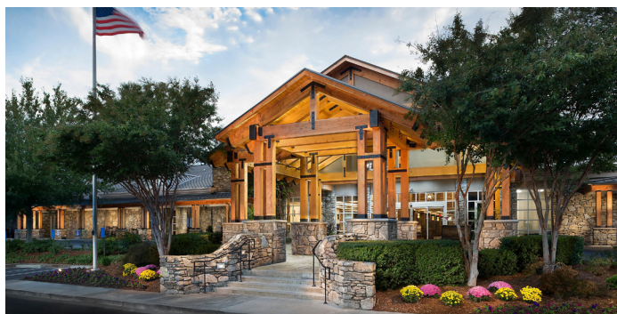
2021 Fall Educational Conference Asheville, Crowne Plaza Hotel October 6-8, 2021